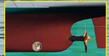
1 sternthruster of 800 kW