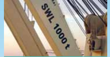
2 cranes of 1,000 mtons SWL lifting capacity each, in combination 2,000 mtons