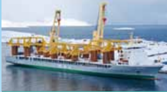
Unobstructed working deck of 128.50 × 27.50 m