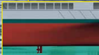
2 azimuths, 1,200 kW each